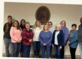
4th Saturday: Christ U