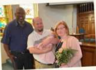
2nd Sunday: Child Dedication