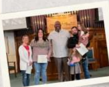
3rd Sunday: New Member