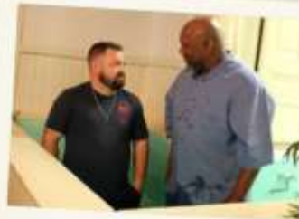
4th Week: Baptism Training